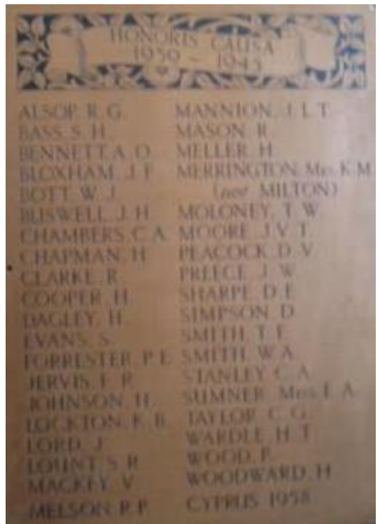
Hinckley Grammar School Memorial

He is laid to rest near his family home at St Peters Church, Aston Flamville.